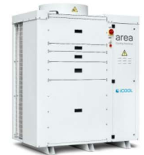
iCOOL MAX 15 CO 2 MT/LT

+ 49 (0)5731 84 266 68 info@wibra.net www.wibra.net