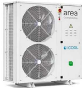
iCOOL 10 MP iCOOL 15 MHP