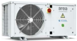
iCOOL 3 MP iCOOL 4,5 MHP