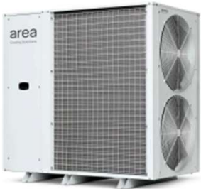
iCOOL 17D MP