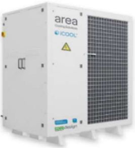
iCOOL 30D CO 2 MT