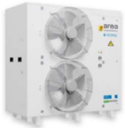
iCOOL 22 CO 2 MT