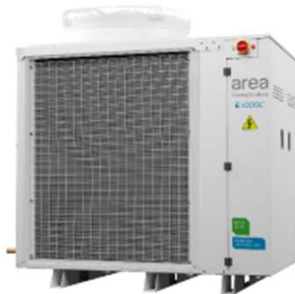
iCOOL 39D MHP iCOOL 43D MHP