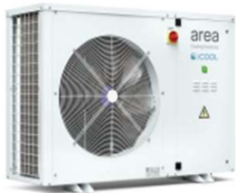
iCOOL 7 MHP iCOOL 10 MHP iCOOL 12 MHP